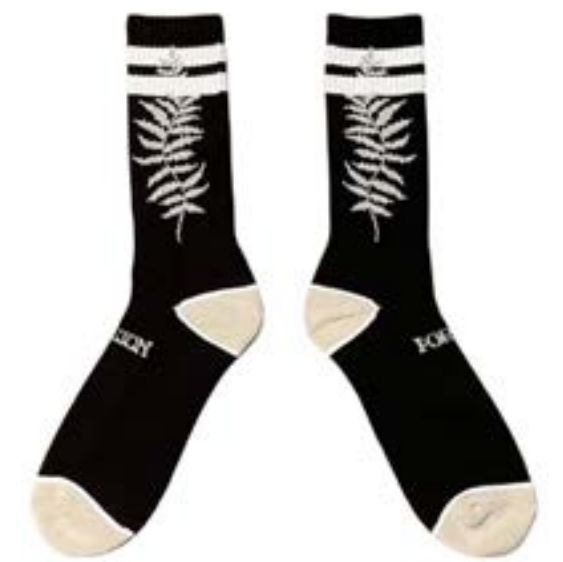
FERN SOCKS Comfortable, Breathable, Durable One Size Fits All 70% Cotton, 28% Polyester, 2% Spandex