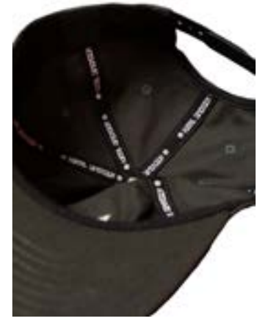
PORTAL DIMENSION HAT