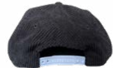
PORTAL CORDUROY HAT