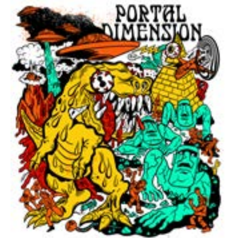
Bermuda Triangle T-Shirt Art By: Wooden Cyclops 100% COTTON FIT HAND SCREENPRINTED